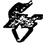
1339..... $1.00 Each GM Door Flange Weatherstrip Fastener 1937