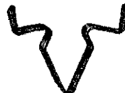
2081C..... .60 Each Weatherstrip Fastener, Chrysler 60'S

Restoration Specialties Serving YOU since 1974.