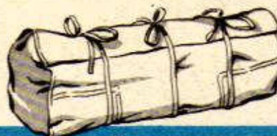
LIFE RAFT KIT (Closed)