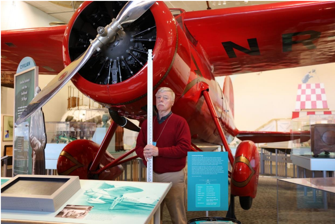
Figure 2. Reference photograph of Earhart's Vega 5B (Photograph 6I3A0016.JPG). 1

Nonetheless, photograph 6I3A0016.JPG shown in figure 2 is sufficient to establish the height of Earhart. The overall approach is to scale figure 1 to match figure 2. This will be done by using the horizontal mirror of figure 2; correcting figures 1 and 2 for barrel distortion and rotational error; scaling figure 1 to match figure 2; overlaying figure 1 on figure 2; reading the surveyors scale in figure 2 to measure elements co-planar with the propeller in figure 1; correcting for measurement confounders if and as needed including: the Vega's display angle; the Vega's vertical lift by the jack stand; the Vega's tire compression; Earhart's shoe heel height and top crown hair height.