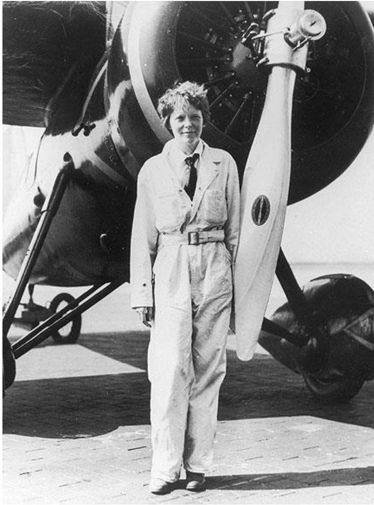
Figure 1. Earhart standing co-planar with Vega 5B propeller. (Photograph amelia-earhart-435.jpg)

A reference photograph of Earhart's Vega 5B using a surveyor's rod as a scale was taken on Monday, January 11 th , 2016 with the same perspective as figure 1 (Figure 2).