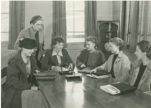
November, 1935 at Purdue University. Earhart was extremely popular as a career counselor for young women.