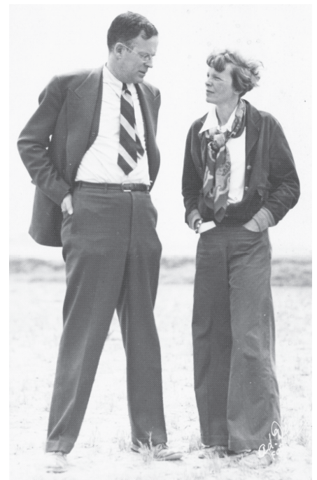
Earhart’s husband and manager, George Palmer Putnam, saw financial opportunities in Purdue University’s enthusiasm for its association with Amelia.

Without mentioning the make or model, Putnam said there was an airplane available that fit the bill. “It embraces refinements and improvements whose practical demonstration can be important factors in commercial aeronautical progress.” It was a multi-engine aircraft capable of sustained flight on one motor. It had a maximum cruising speed of over 225 mph and a cruising range, with full load, of over 6,000 miles. Equipped with “special tanks, instruments, and other devices,” this marvelous machine was not an experimental ship but rather a “development of proved design.” It could be had as either a stock model or a “custom-built job” for a base price of $30,000. “The maximum total cost, including special equipment, preparation, flight outlays, etc., would be $40,000. That figure would be the guaranteed top.” 12