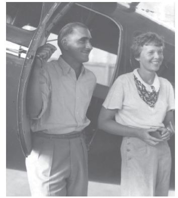
To help her prepare for her January 1935 flight from Honolulu to Oakland, Earhart hired dapper Hollywood stunt pilot Paul Mantz for $100/day.

Along with a change in focus came a change in residence. For most of her flying career Earhart had been based on the east coast and, since marrying George Putnam in 1931, had lived in Rye, New York, a small town on the north shore of Long Island Sound about twenty miles from the City. Late in 1934, in preparing for the Honolulu to Oakland flight, she needed to be near her new technical advisor, Hollywood stunt pilot Paul Mantz. His company, United Air Services, Ltd., was based in Burbank, California on the same airport with the Lockheed factory. Earhart rented a house nearby. She loved it there – the warm climate, good flying weather, vibrant aviation community – and she enjoyed rubbing elbows with the constellation of Hollywood stars in Mantz’s circle of friends.