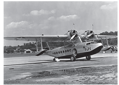
Entering commercial service in 1935 as the "Baby Clipper," the Sikorsky S-43 amphibian was later operated by the U.S. Army Air Corps as the OA-8 and by the U.S. Navy as the JRS-1.

The document begins with a detailed review of Purdue's six years of "continuous and persistent effort" 54 devoted to aeronautical research and the university's specific desire to explore the mysteries of high-altitude flight. The stratosphere's "strong, undisturbed, unidirectional winds or drifts which are much more favorable to flight than the violent disturbances which haunt the heavier strata enveloping the earth." 55 (These winds would eventually be named the Jet Stream.) Meikle noted that, "The real task of exploring the possibilities of flight in the stratosphere is yet to be undertaken. The craft which will successfully penetrate it and maintain prolonged flight in comfort and safety has yet to be designed." 56 Unbeknownst to Meikle, Lockheed and the Army Air Corps were, at that moment, designing the XC-35, a pressurized Electra with turbocharged