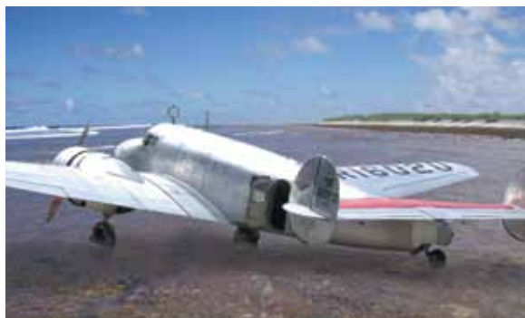
Radio signals believed to be from the lost plane were heard for the first five nights after the Electra disappeared.

For the first five nights after Earhart disappeared the dogs were fairly baying at the moon. Scores of radio signals believed at the time to be distress calls sent from the missing aircraft were heard by professional operators, licensed amateurs, and ordinary people listening on their home sets. The first week of the U.S. Navy's search was based on the theory that the calls were genuine and were being sent from one of the islands in the Phoenix Group. USS Colorado steamed south from Pearl Harbor with orders to search the reefs and islands but by the time the battleship reached the area, the signals had stopped.