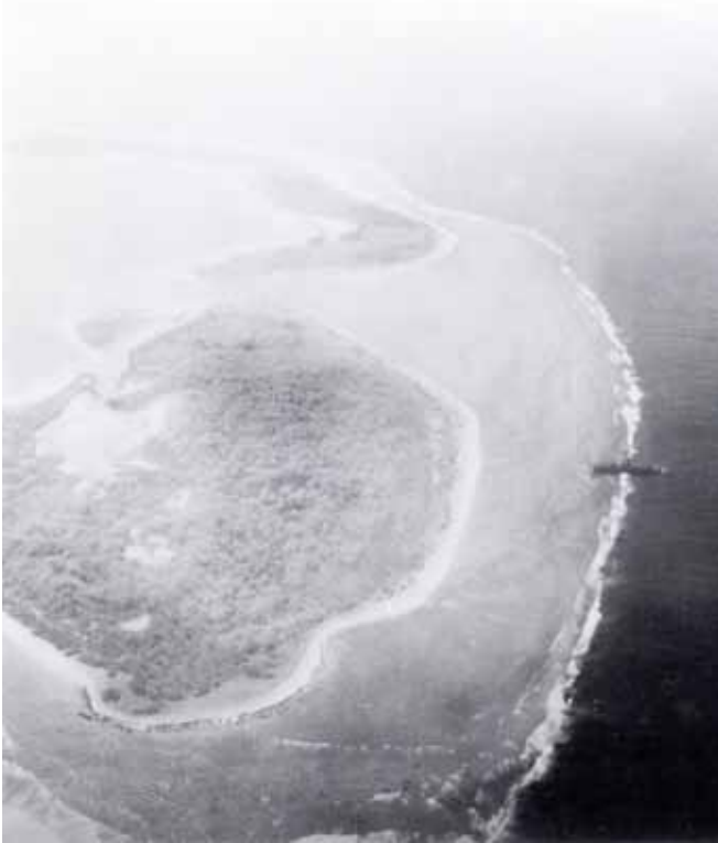
This December 1, 1938 aerial photo clearly shows the shipwreck on the reef but the object in the 1937 Bevington Photo is not discernible.

object in the October 1937 photo is either gone or hidden by the surf.