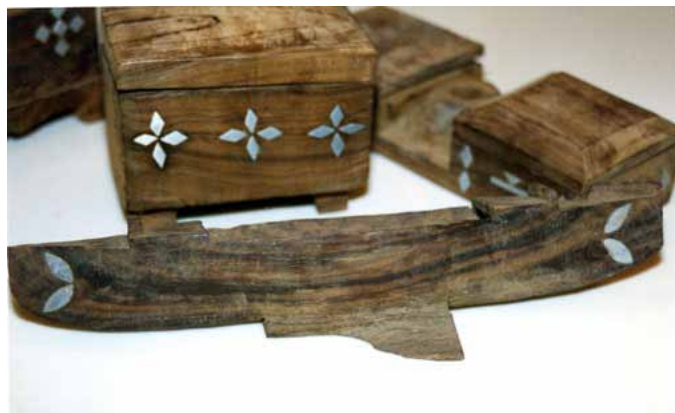
During later war years, American servicemen bought or traded for carved wooden items inlaid with metal said to be from "the downed plane."