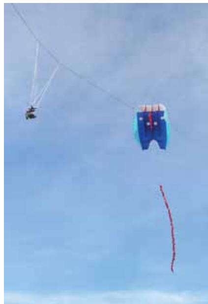
Kite Aerial Photography (KAP) uses a small digital camera mounted in a powered cradle suspended from the string of a kite flown over the target area. It's an economical way to get high-resolution aerial photos in remote locations. Pole Aerial Photography (PAP) uses the same principle but the camera cradle is attached to a long pole.

There are vertical relationships to be recorded, too. For example, by carefully examining such relationships we were able to determine that a lot of small clams were deposited on one small part of the site, then a layer of asphalt siding was laid over them, and then some corrugated iron was