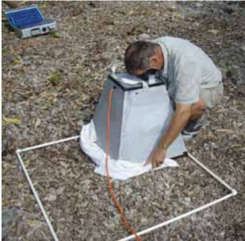
John Clauss uses the UDUS to scan for bones or teeth at the Seven Site in 2007.

The top 3-5 cm. of the site is a sort of pavement of coral gravel, a deflated surface through which the smaller-grained material has sifted. As a result, artifacts and features tend to be hard to see even though they're virtually on the surface,