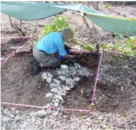
Lonnie Schorer exposes Clambush 2 in the SL-3 unit during the 2007 expedition.

“ Clambushes. ” Clambush is a term we made up for clusters of Tridacna (“giant”) clam valves, clearly the remains of someone’s clambake. We’ve found two, creatively labeled Clambushes 1 and 2.