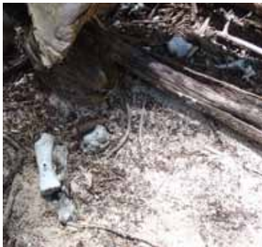
Pig bones.

During the day yesterday a group visited the pig taphonomy experiment site from Niku V in 2007. It was a very interesting experience. By the end of the trip last time, all edible material had been stripped from the bones of the pig, and the crabs seemed to have lost interest in the dry bones. The visit yesterday confirmed that thought: the bones were still there, right where they've been for three years. They had been washed somewhat inland by a storm, but otherwise were undisturbed.