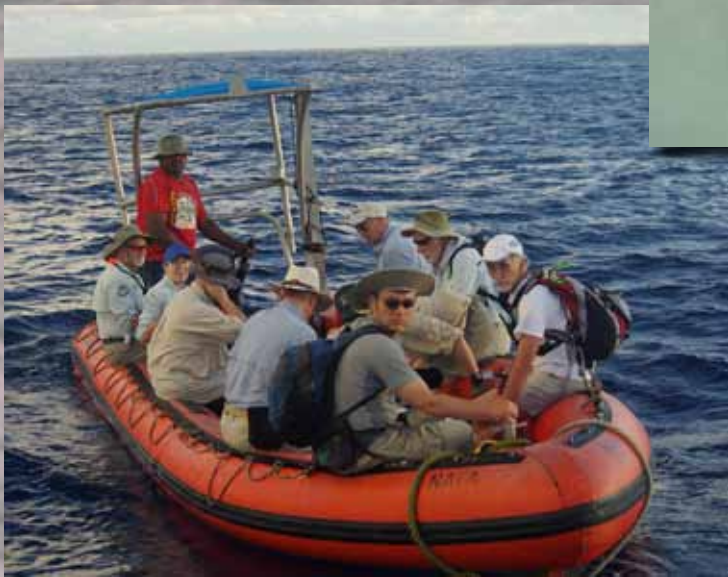
First boat away.

Morale is very high and everyone is ready to get to work.