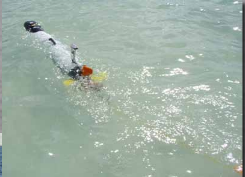
The AUV "torpedo."