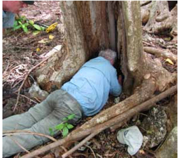
Art fishes for artifacts in a crab burrow.

going to grab him. Days like that make you really grateful for that fresh water shower and laundry service aboard.