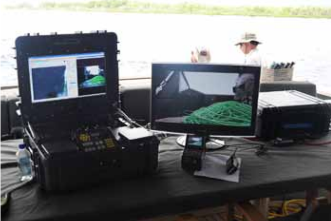
The ROV station aboard VvS1.

After dinner, a skiff went to VvS1 and brought those folks over for the team meeting. We're glad this works, there was some concern over transferring from skiffs to boats in the dark, but both boats are equipped with excellent lights and all went well.