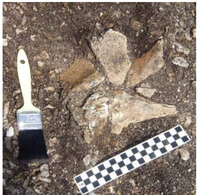
Excavation of turtle bones.