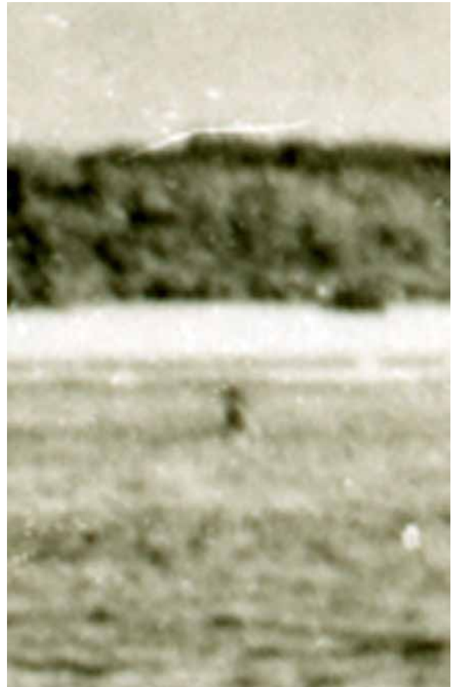
"Nessie" – man-made object seen in a photo taken in 1937 by Eric Bevington.

Today the work at the Seven Site will continue. During the first half of the day, Gary, Mark and Ric will be landed on the north side of Taziman Passage, and they will walk around the north side of the island to investigate the site of "Nessie" out on the reef. Today promises good weather and a very low tide, so it's a good day to make this excursion. We don't really think there's anything still there, but we have to look.