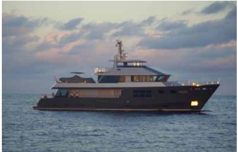
VvS1 at daybreak.

VvS1 is happy to serve as a platform for the ROV. All the gear was transferred, and with the long cable they went right to work north of the Norwich City . The first major discovery is that there is a big, wide shelf at around 900 feet. It has coral boulders on it, so it could easily have airplane wreckage on it. They'll be working that level very intensively with high definition video over the next few days.