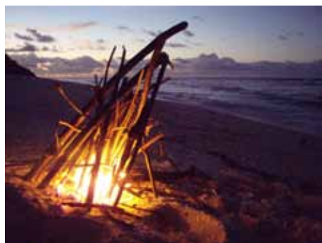
Campfire on the beach at sunset.