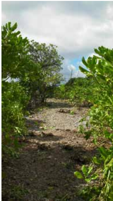
A trail to the sea.

The other thing about them that was very interesting is that they looked old. Much older than three years. As old, in fact, as Gallagher reported “his” bones looking: gray, pitted, dry. The bones will be collected and used for comparison and visual training.