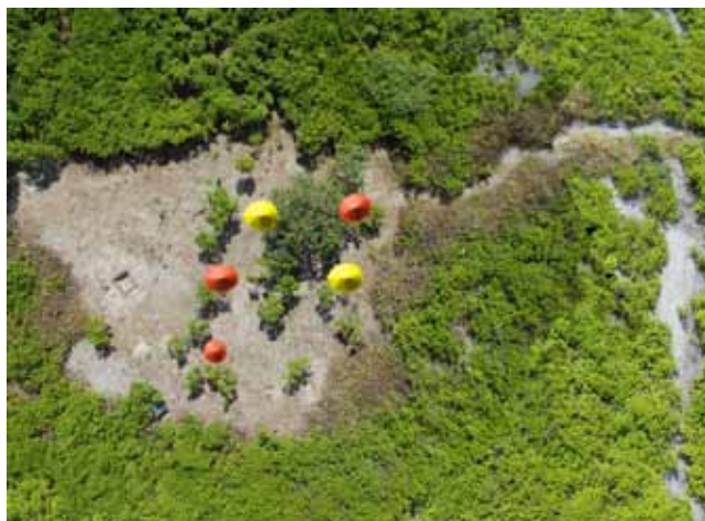
Approximate locations of the Seven Site fires around the big ren.

The Seven Site is now defined northward. Enough work has been done towards the Buka forest that a boundary can be set. Today, the lane cut by Bill and Karl will be surveyed and metal detected in hopes of finding a similar "edge" to the south.