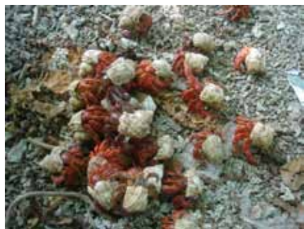
Strawberry hermit crabs in a frenzy over some small piece of food.

A very straightforward day yesterday, with operations continuing at the Seven Site in an orderly fashion. Ric found yet another fire feature, with some metal stuff in it. They don't know what the metal stuff is yet, or what it might be,