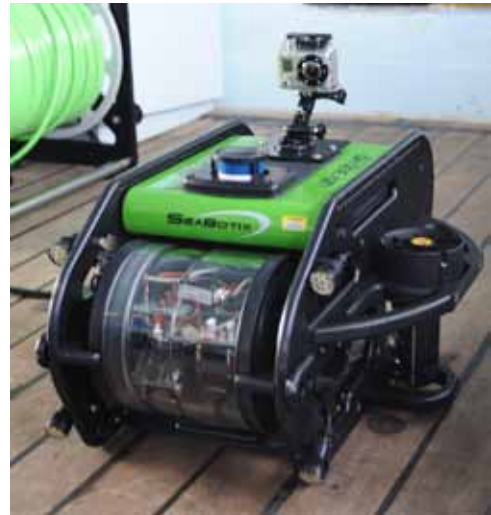
The Seabotix ROV.

Jesse began the lagoon survey with the AUV and completed about 10% of the area in the first day. Last night, he put the ROV over the side of Nai'a for testing. They had two large flat screen monitors set up where everyone could watch as he “flew” the ROV under