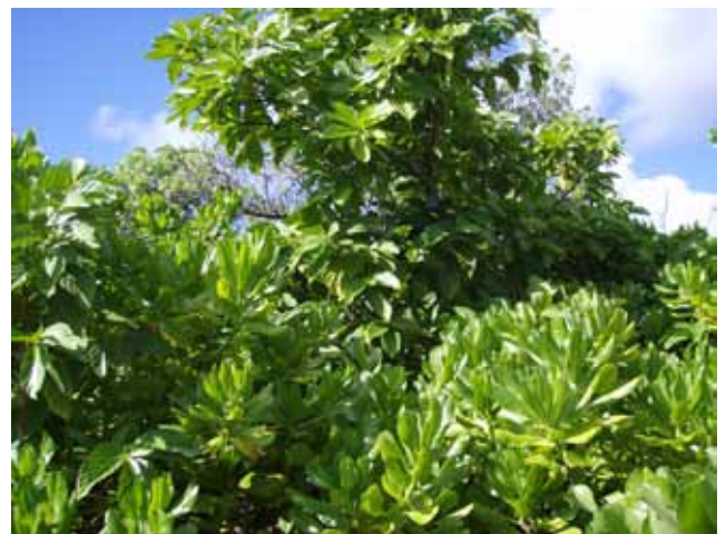
Scaevola frutescens, with a ren (Tournefortia argentea) in the background. All to be cleared.

Otherwise, it's a scaevola-whacking day. The Seven Site must be cleared completely in order to begin to execute the plan for excavation. Not just cut down, but all debris carried (not dragged!) away, leaves picked up, surface litter removed, all in 110° heat. This is not fun.