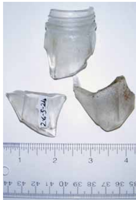
TIGHAR Artifact 2-6-S-21b and 2-8-S-41a&b are pieces of a hexagonal clear glass bottle.

The better the hypothesis, the better our chances that, in testing it, we'll find the proverbial smoking gun. ❖