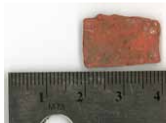
TIGHAR Artifact 2-8-S-30, one of three fragments of red material identified as consistent with an early twentieth-century cosmetic.