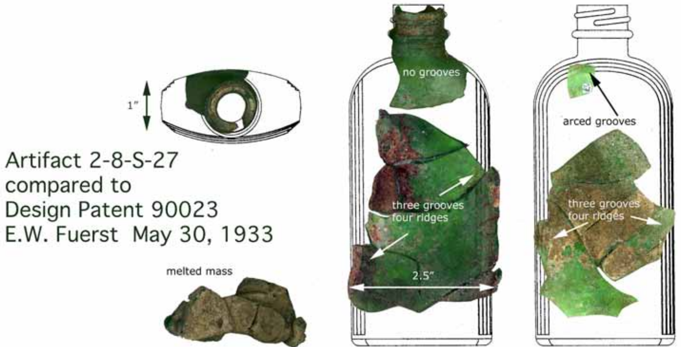
Artifact 2-8-S-27 compared to Design Patent 90023 E.W. Fuerst May 30, 1933