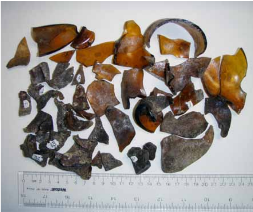
TIGHAR Artifact 2-8-S-25 is a broken bottle similar to the American pre-war returnable beer bottle pictured. Fragments: TIGHAR photo. Bottle: Courtesy Bill Lockhart.