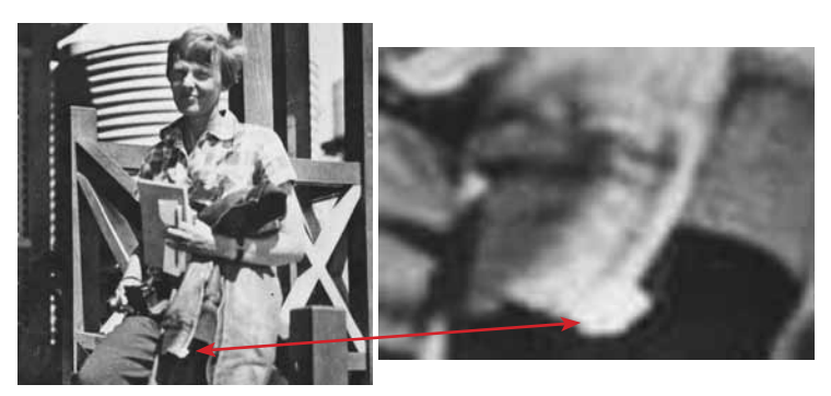
This photo was taken when Earhart was in Darwin, Australia. Although the resolution is poor, the zipper pull on Earhart's jacket appears to be rectangular.

could have been in a jacket or heavy duty trouser." Indeed, the example we have of the Talon 06 Autolock zipper is on a jacket. Amelia, of course, had a leather jacket with her on the world flight and Talon records show that the company provided zippers to a manufacturer of leather flying jackets as early as 1929. Photos taken prior to Earhart's first world flight attempt clearly show her jacket to have a bell-shaped pull. Photos taken during the second world flight attempt, although of poorer quality, seem to show a smaller rectangular-shaped pull. Maybe the zipper broke and was replaced. Forensic imaging may be able to pull out more detail.