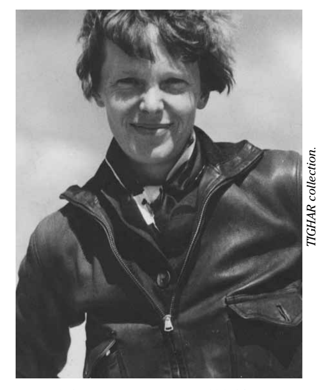
This photo of Earhart was taken in 1936. The leather jacket appears to be the same one she wore during the world flight. The zipper pull is clearly bell-shaped.

So how do we test the hypothesis that Artifact 2-8-S-3 came from some item belonging to either Amelia Earhart or Fred Noonan? The first logical step is to look for zippers in photos taken during the world flight. Earhart wore slacks that closed with zippers on the hips and we initially thought we might have a hip zipper, but Mr. Allyson wrote, "The size 06 zipper is considered to be a medium to heavy duty product. ... for the navigator it