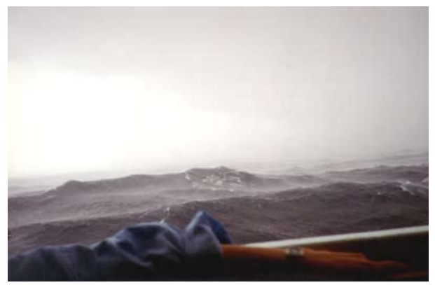
Storm at sea: a white squall approaches in 1997.

Niku III was certainly an adventure, but adventure was not what we were after. We had succeeded in disproving another hypothesis, and it had nearly a cost us of our lives. Forced to seek sheltered water on the way home, we put into Funafuti in Tuvalu where we hoped to catch a flight back to Fiji – but