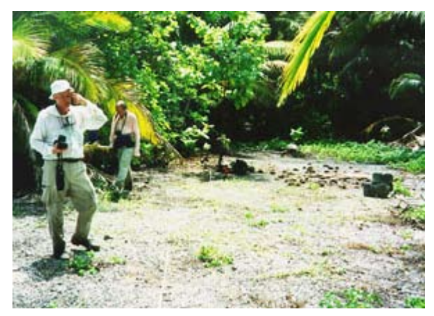
The gravesite on Aukaraime.

Big disappointment. The grave held the bones of a tiny, probably still-born, infant. Meanwhile, over on the north shore, an exhaustive and exhausting survey of the beach front turned up no sign of a water collection device.