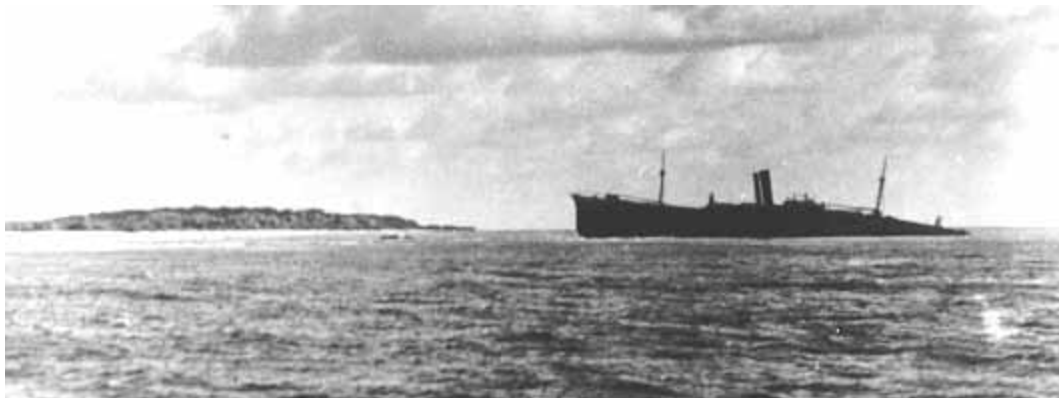
The S. S. Norwich City in 1937.

Five days later Gallagher replies. His information about the wreck of the Norwich City "derived from gossip only," is not very good. The freighter went aground on the reef November 30, 1929 off the island's northwest end with the loss of eleven lives—five British seamen and six Arab stokers. Three bodies washed ashore and were buried. The twenty-four survivors were all rescued five days later by S.S. Trongate out of Samoa. No one was left on the island.