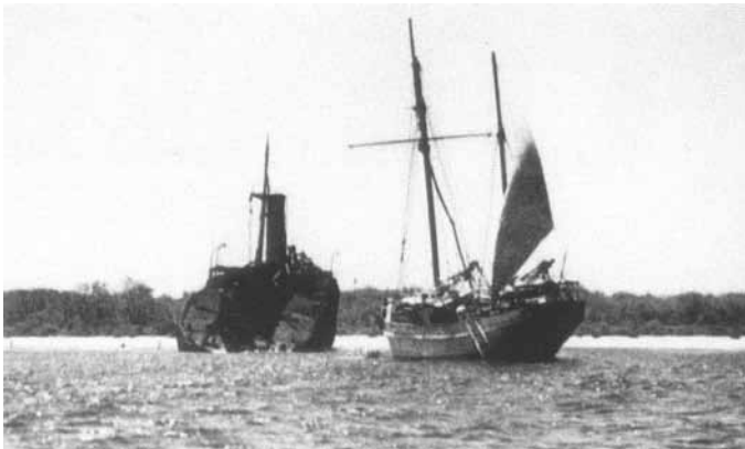
R.C.S. Nimanoa, tied off to the wreck of the Norwich City, 1937.

This is a letter rather than a telegram. The original probably accompanied the shipment to Suva. R.C.S. (Royal Colony Ship) Nimanoa was the rather decrepit sailing vessel that periodically serviced the islands.