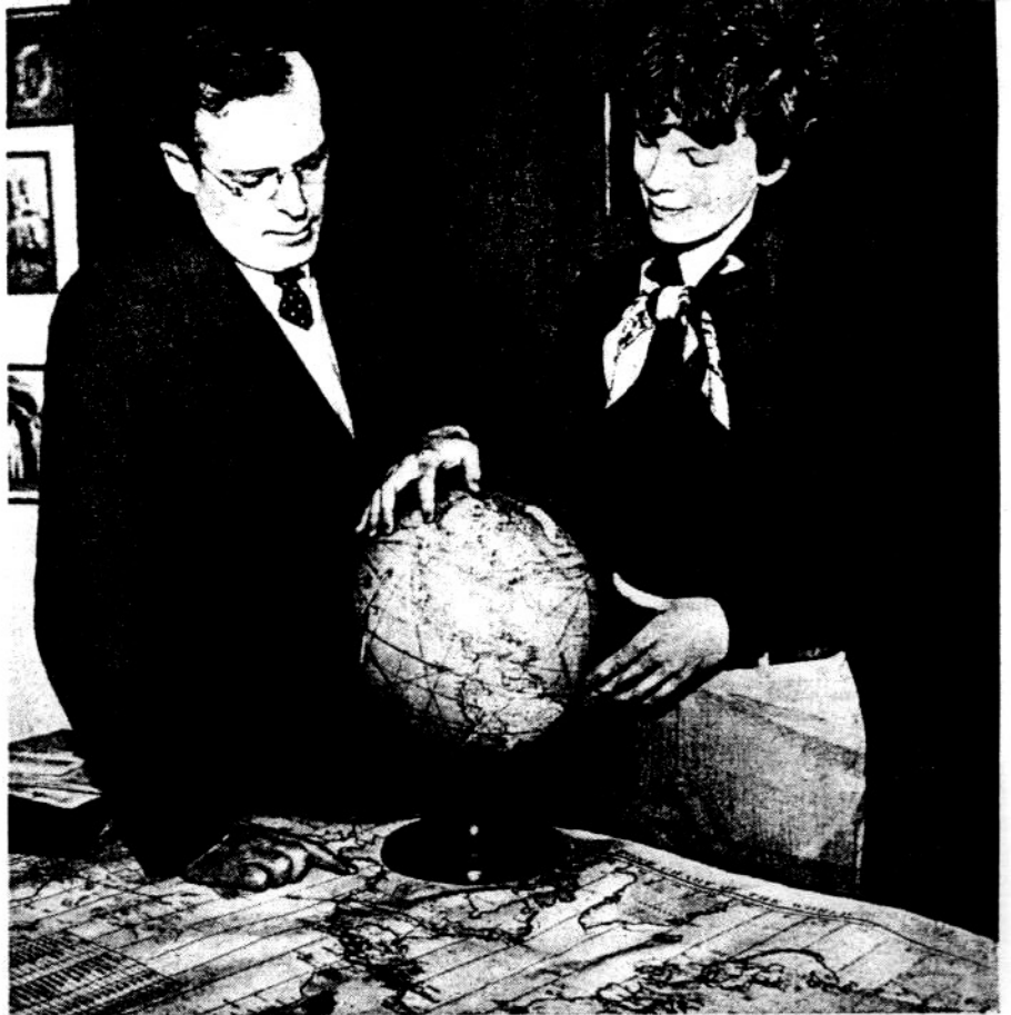
George Palmer Putnam spent thousands of dollars searching for his wife after her twin-engined Lockheed disappeared at sea. Above, they are planning fateful flight.